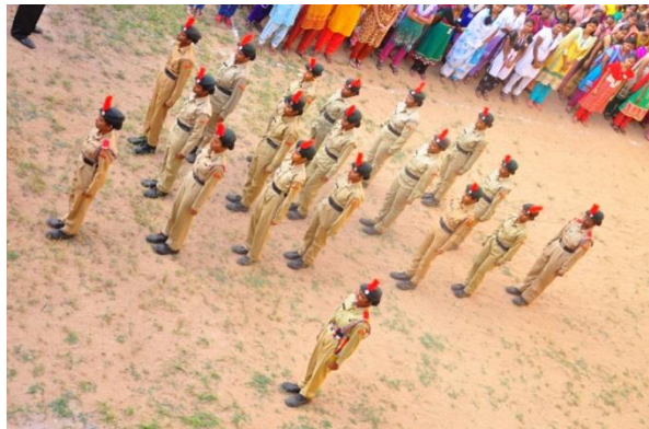
Republic Day Parade, SMC

Republic Day Camp is considered as the most prestigious opportunity by all the NCC cadets. Cpl. J. Leema Mano Victoria from English department was selected for pre - IGC level RDC from the senior wing of 3 TN Girls BN NCC which is a honour to our NCC Unit and college. Our cadets usually conduct Republic Day parade in a grand manner with utmost celebration inside our college premises on Republic Day. TSC comes next to RDC, five of our cadets have attended TSC – IUC camp which is again a great honour to our battalion.